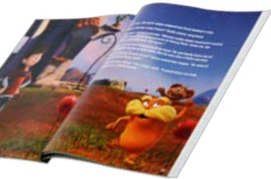
Produce high-coverage publishing applications.

High print permanence. An independent testing institute, Wilhelm Imaging Research, has verified the permanence of HP Indigo photobook prints. A WIR dark permanence rating of more than 200 years for HP Indigo prints ensures excellent long-term stability and freedom from gradual yellowing when stored in albums and other dark locations. The display quality of HP Indigo prints was also confirmed in WIR testing.