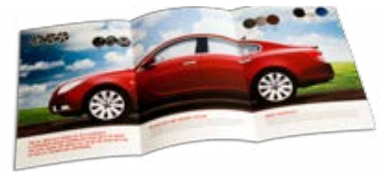
High productivity for large-sized marketing collateral.

PrintOS. Print Beat provides visibility to press performance to drive continuous improvement to print operations. PrintOS Site Flow efficiently manages any number of jobs per day, even hundreds or thousands. Automate, simplify and streamline files submission with PrintOS Box. Use PrintOS Composer for heavy VDP processing including sophisticated HP SmartStream Mosaic campaigns.